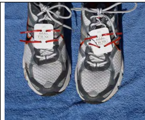
Insert Twist Ties Into Holes On Chips