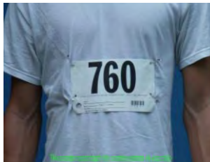
Proper Front Bib Number Placement

BIBS MUST BE PINNED TO THE FRONT & BACK OF THE RUNNER. THERE ARE 2 HIP NUMBERS FOR EACH ATHLETE INCLUDED IN YOUR PACKET. PLEASE PLACE THESE ON EACH SIDE OF YOUR HIPS AS TO HELP WITH VERIFICATION AND BACKUP OF THE FINISHLYNX CAMERA.