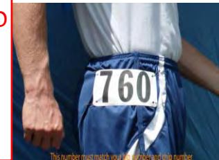
Proper Hip Number Placement

Your BIB number is marked on the chip. Please make sure you put the correct number facing up. The chip may also be tied into your laces of your shoe if you wish, as a extra precaution use a twist tie in conjunction with this method