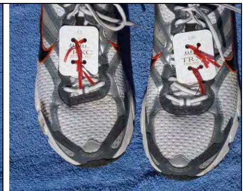
Twist Ties To Secure Chip To Shoe