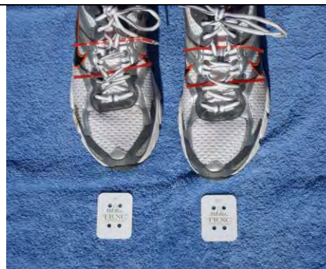
Insert Twist Ties into Laces