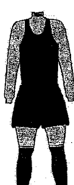
Second layer undergarments that extend Below the knees must both be same color or it is