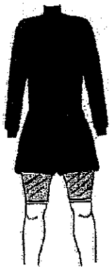
Undergarments that ends Above the knees may be multiple colors