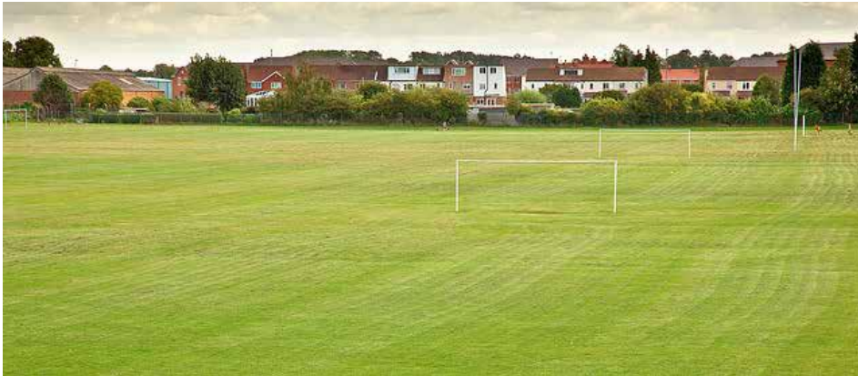
At Left: Spital Park, Castle Donington, England. Home of Castle Donington FC & Melbourne FC.

The system here is like no other in the world. And it works, well. From the facilities to the number of attendees for youth sports, it is unprecedented everywhere else in the world. Your athletes are fortunate. Fortunate that the facilities that they practice and play on are of such high quality and that there are people willing to come and watch them week in week out, and even pay for that privilege.