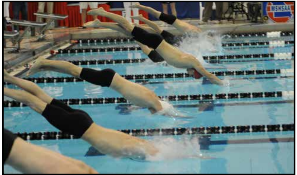
It is permissible for a local school to give a student-athlete permission to miss swimming practice in order to compete in a non-school swim meet, per By-Law 235.1-c-1. This issue, along with cooperative programs and others are the focus of this issue's Q&A section.

Question 2: School A, a Class 1 school, is bordered by a Class 5 school, a Class 2 school and a K-8 district. School A wants to co-op with the Class 1 school on the other side of the K-8 district which is not contiguous to School A due to the K-8 district. May this occur since there is a Class 2 district which is contiguous to School A? Answer: Yes, provided cooperatively sponsoring the program(s) with the contiguous class 2 school is not an option as all co-ops must be with mutual approval of both school districts. Your school or the class 2 school is not required to